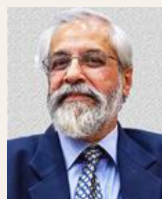
Mr. Justice Madan B. Lokur

Former Chief Justice of India & Former Chairman of the National Human Rights Commission