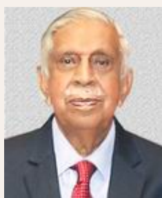
Mr. Justice M. N. Venkatachaliah

IIAM is guided by an Advisory Board, comprising of eminent, credible and distinguished professionals having rendered outstanding service in the field of law and ADR. They guide the Institution on procedural and ethical aspects concerning ADR. IIAM, being APCAM India, it is also guided by an Advisory Board, comprising of the most experienced and credible names from diverse jurisdictions around the globe. The Advisory Board includes former Chief Justices or Judges of the highest court of the country, reputed Academics or Senior Lawyers actively involved in the field of arbitration, mediation or other ADR options, or distinguished professionals having rendered outstanding service in the field of ADR