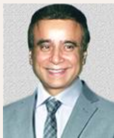
Dr. Madhav Mehra

Former Judge, Supreme Court of India and Judge Supreme Court of Fiji